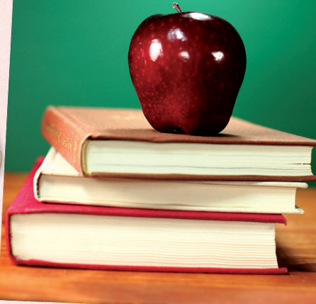
Our print directory!